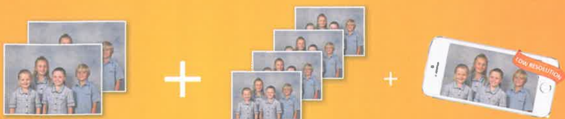
2 x 5" x 7"