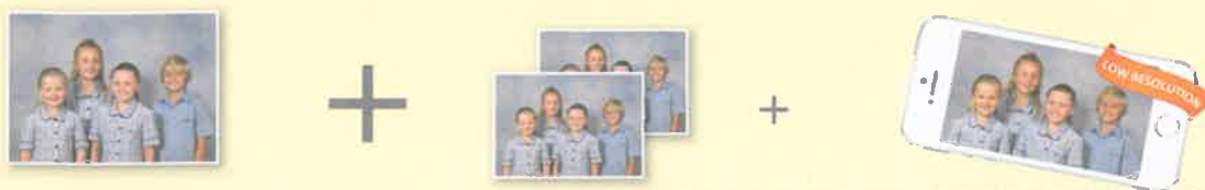
1 x 5" x 7"